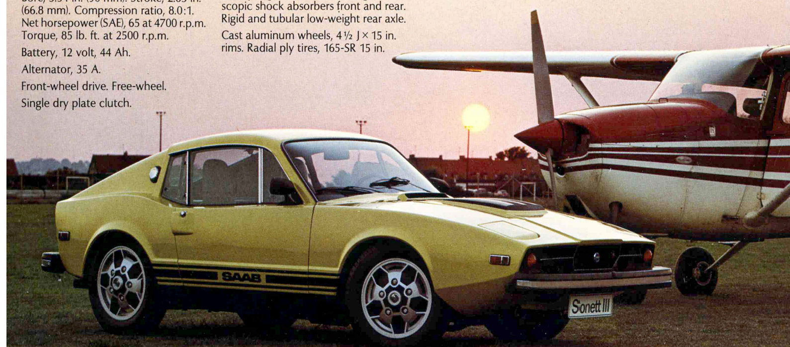
This is a reproduction made by courtesy of Saab Automobile Trollhättan

IN 19352 PRODUCTION - TEMAWEZATA, GBS PRINTED IN SWEDEN